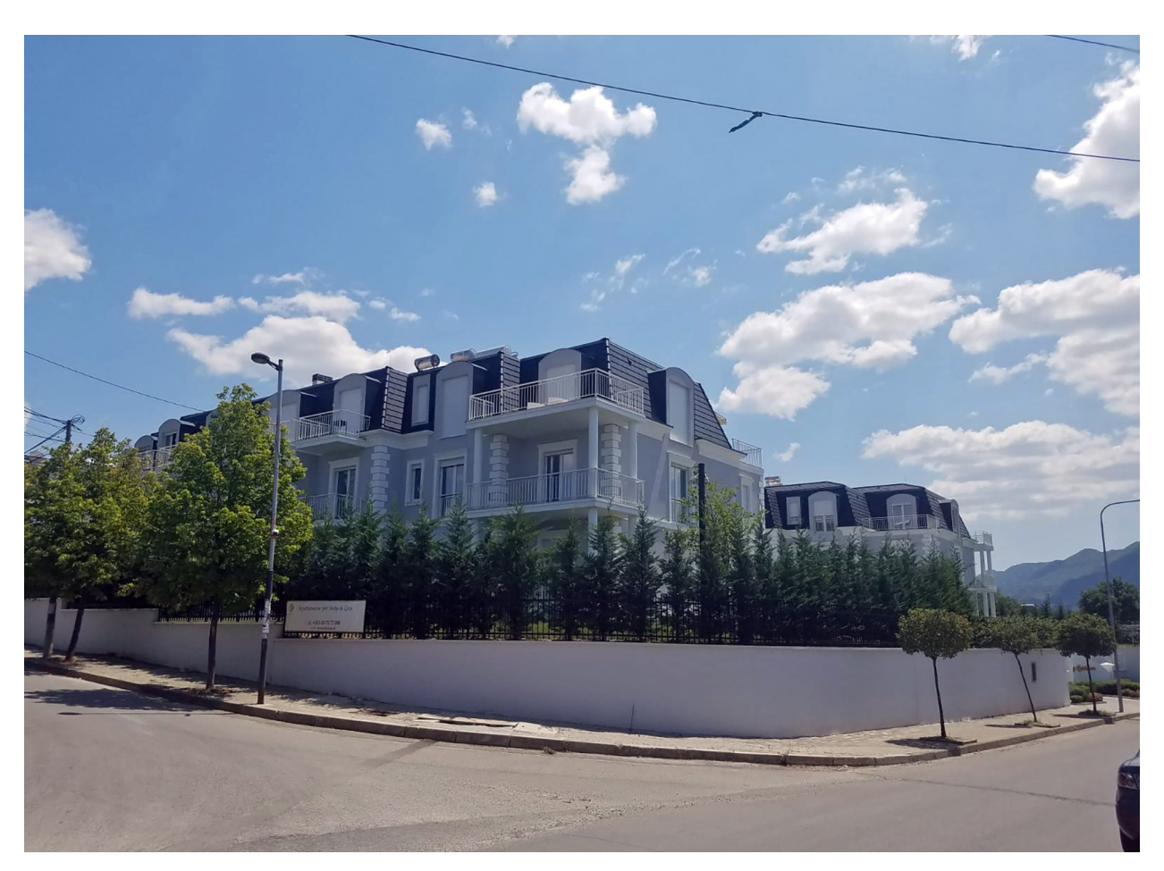
Fig. 2: Rolling Hills Luxury Residences, Farka AU.

Tirana city region seems grounded in the evolving complexities and contradictions of urban life.