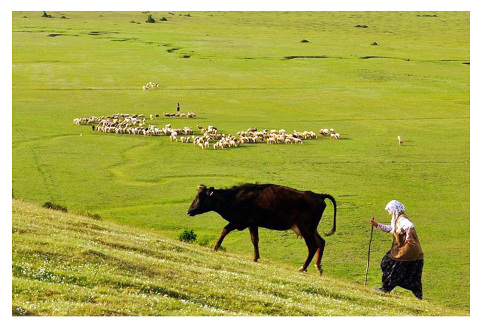
Fig. 2. Traditional livestock activities in the study area.

This study focuses on the role played by the slow tourism movement in sustainable development, which is a result of its status 'Cittaslow'. In this regard, the effect of being a slow city in local sustainable development has been evaluated from the perspective of both tourists and locals.