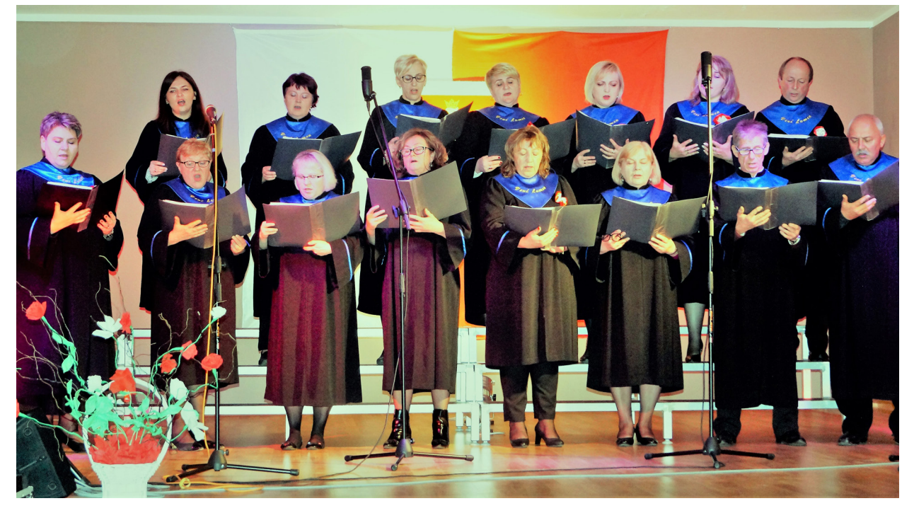
Fig. 7. The Veni Lumen choir at the commune cultural centre in Borek Strzeliński.

The integrating role of the library, which appeared in all interviews, is expressed not only by enabling performances and rehearsals of music bands but also by organising a series of cyclical events that aim to intensify social relations in the countryside. Some say that the library is the best thing that happened in Borek. The positive role