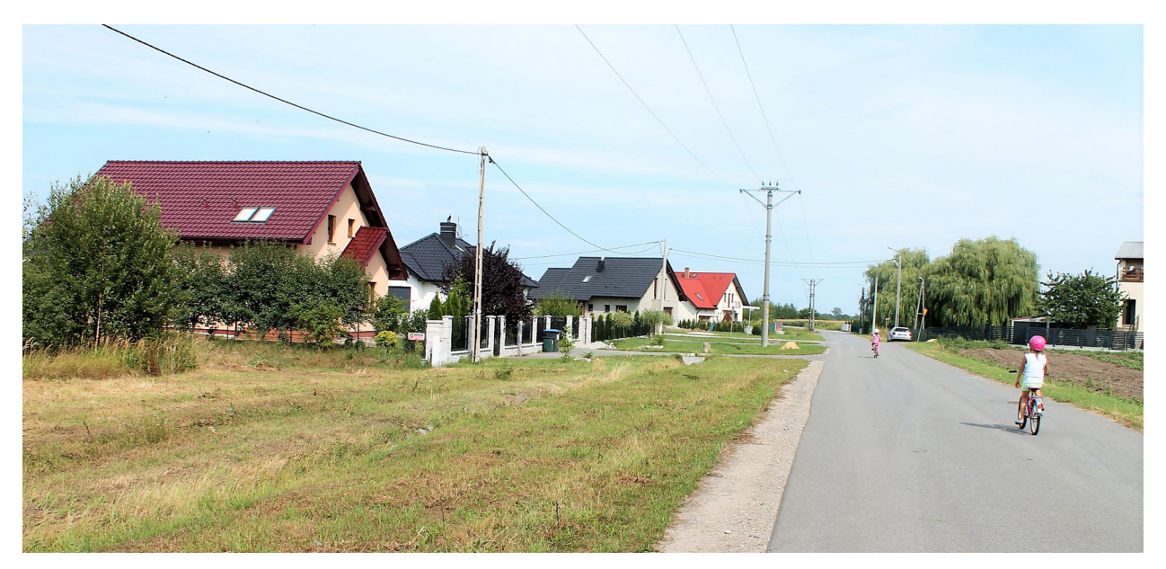
Fig. 5. A new model of the settlement space of Borek Strzeliński in its northern area – a villa type characteristic of a suburban area.

The period between 2013 and 2019 – construction of new houses in the area indicated above by residents from other places; at the same time, the old settlement fabric is being renovated (many owners renew the facades of their parents' or grandparents' houses). In 2016, the former railway route disappeared from the village landscape, replaced by a half asphalt road. The bushes were destroyed, and it was stripped of trees. The