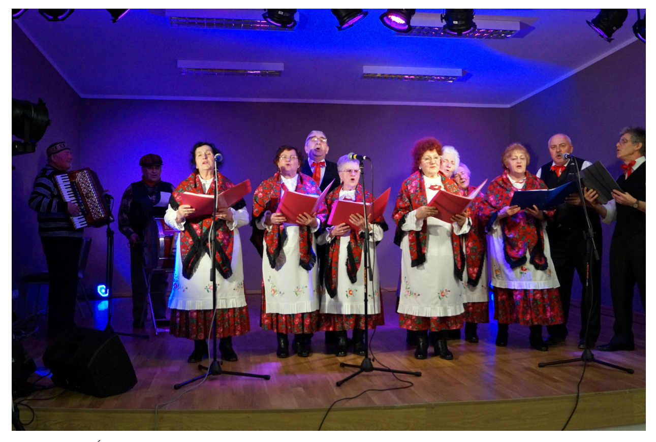
Fig. 6. The Ślężanki Folk Group during a performance at the Culture Centre in Borek Strzeliński in 2017.

The interviews emphasised the culture-forming role of this organisation. People were proud