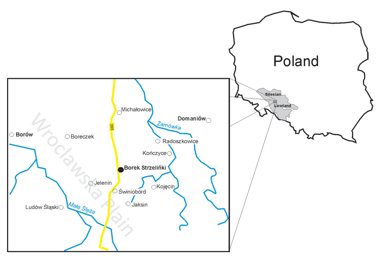
Fig. 1. Location of Borek Strzeliński against the background of the region and Poland.

and sugar beet) on soils from first to third grades. However, in terms of historical and landscape regionalisation, Borek Strzeliński is located in the Wrocław region (Plit 2016). At present, Borek Strzeliński is a village of 1,656 inhabitants.<sup>2</sup> The village has a parish church and cemetery, a primary school, a library, a cooperative bank, four stores (two groceries, one general and one with parts for agricultural machinery), two hairdressers, a tailor, a florist, a beauty salon and a furniture factory, International Deco Logistics Sp. z oo .