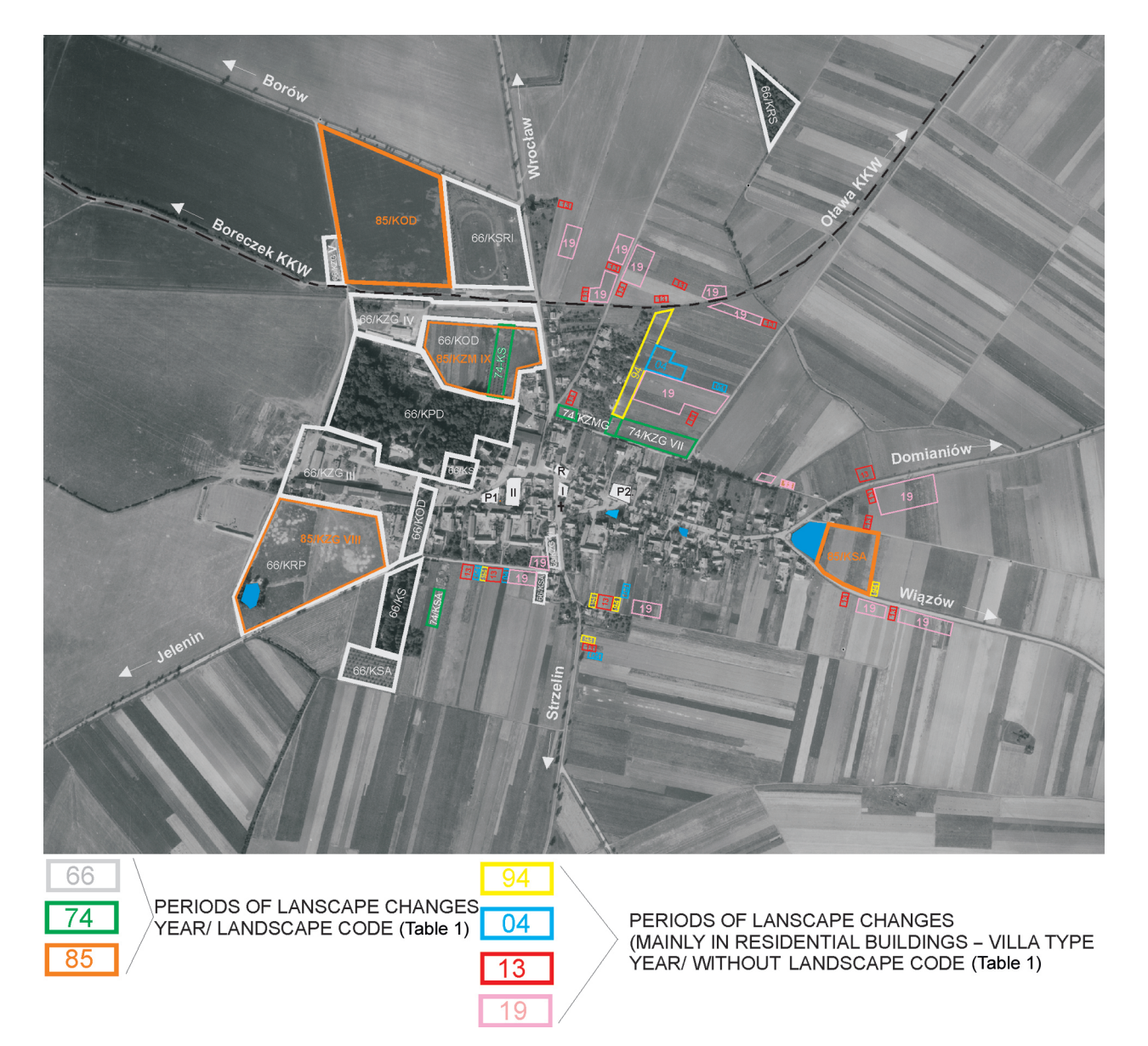
Fig. 2. Structure and function of landscape transformation of Borek Strzeliński in the period 1966–2019.

Settlement landscape – compact occupying the central part of the village surrounded by agricultural fields visible in the aerial photograph from 1966 (Fig. 2). It is represented by brick buildings of two types, residential and farm buildings, in an area extending up to 20 ares. The first type is a farm, usually in the shape of a more or less elongated rectangle with a residential building in the foreground, behind which there were places for smaller buildings (chicken coop, rabbit cages or coy-