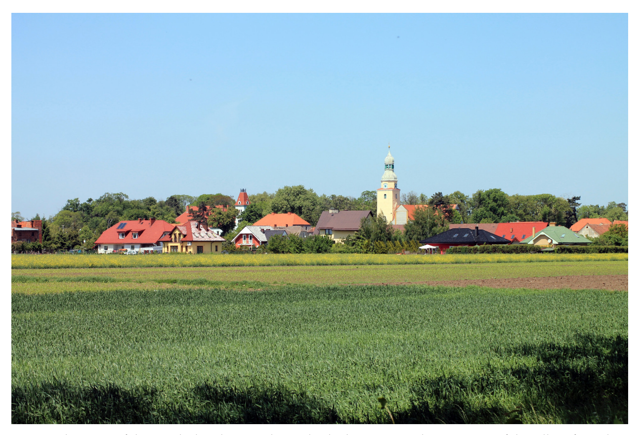
Fig. 4. The tower of the parish church in Borek Strzeliński dominates in the panorama of the village from the south.