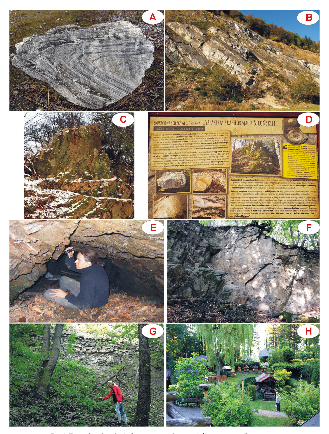
Fig. 2. Examples of geological structures and tourist infrastructure in the quarries. A – Krzyżnik, B – Kletno I; C, D – Sinica, E – Ondraszkowa Dziura (adit of teschenites), F – Grota na Rudowie, G – Na Jasieniowej, H – Na Mołczynie.