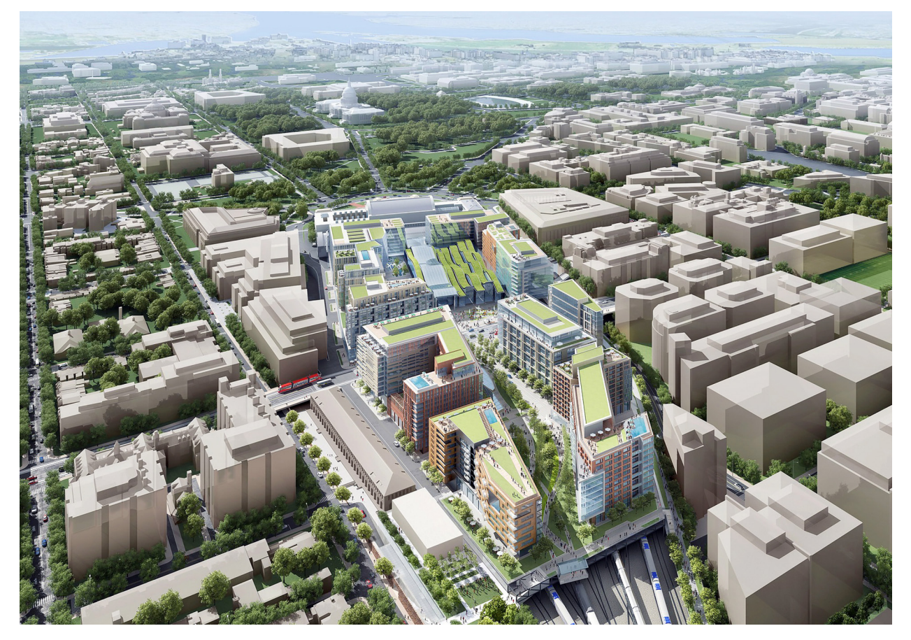
Fig. 1. Vision of Burnham Place Union Station, Washington DC.