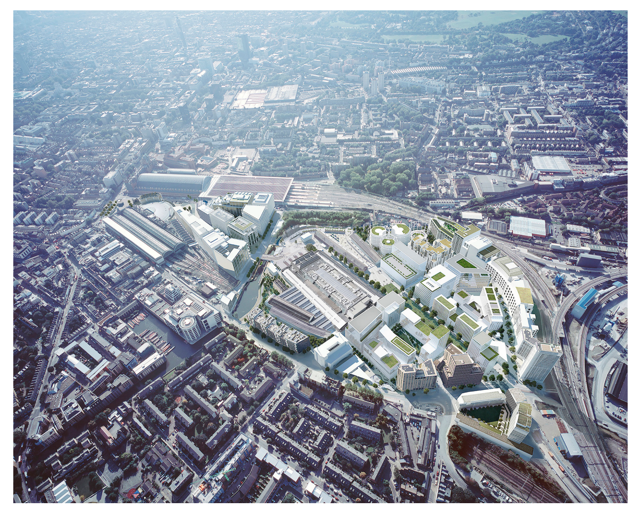
Fig. 2. King's Cross is a mixed-use, urban regeneration project in central London (KCCLP).

urban designers have to understand complex connections throughout the urban fabric while being sensitive to context and resources at the local level as a prerequisite of their intervention (Campbell, Cowan 2002). Building on these previous descriptions, we see ReUrbanism as a ra tional urban planning and design approach where the city is seen as an addition or complement to the constant urban fabric within existing building stock, where it produces density and stable condi tions throughout the space enabling a complex set of spaces to come together in a contextualised, pro grammatic and complete manner .