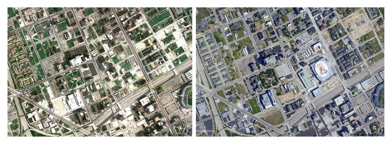
Fig. 4. Focus area of central Detroit, USA. Left, 2005. Right, 2017.

Detroit is not alone in this situation, reflecting this loss of the population. According to Hackworth, "269 neighborhoods in 49 American Rust Belt cities have lost more than 50% of their housing since 1970" (2016: 3). In the years before the highly publicised 2013 municipal bankruptcy and subsequent restructuring, and before the 'turnaround' became visible, Detroit had been well known for its macabre urban condition often captured by 'ruin-porn' photographers, witnessed by urban explorers, desecrated by the unstoppable tide of 'scrappers', and avoided by many due to its stigmas as one of the most dangerous cities in America. Estimates put the number of abandoned or vacant properties in the range of 70,000-90,000, from vacant lots to train stations, factories, churches, schools, hospitals, cultural venues, hotel and apartment buildings, and more single family houses than anyone knows what to do with (Fig. 4) (Detroit Works 2012: 272). This has created a semi-empty-city-condition, and along with the global financial crisis of 2008 and the largest municipal bankruptcy in the history of the USA in 2013, it set the stage for a massive land grab throughout the metro Detroit region as citizens faced foreclosures, and urban land and properties went to mass public auctions.