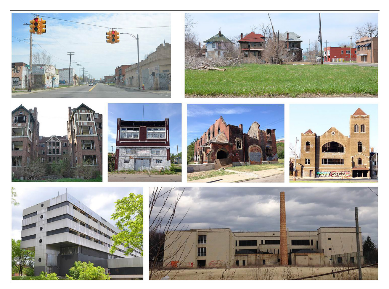
Fig. 5. Abandoned buildings and blighted landscapes showing the effects of the fourth migration.

rebuilding the city, including the rehabilitation of existing structures, construction of new structures, revitalisation of public places, and transit oriented solutions, taken together, exemplifies ReUrbanism. While many actors within the private and public sector converge in the rebuilding of Detroit, two well-known billionaire personalities and their associated corporations have been linked with the "Rebirth of Detroit". Dan Gilbert and his real estate firm Bedrock owns 60% of the land in Downtown Detroit, 90 properties in the urban core, and 1.4 million square meters (Larson 2017; Kiger 2018). North of the Downtown, in what was long known as the Lower Cass Corridor, the Ilitch family and their real estate firm, Olympia Development of Michigan dominate the map. This has created a situation of extremely concentrated land ownership by these two billionaires and their companies, who have largely become the new master-planners of post-bankruptcy Detroit. In effect, their visions for the city have become the gold standard due to two main reasons.