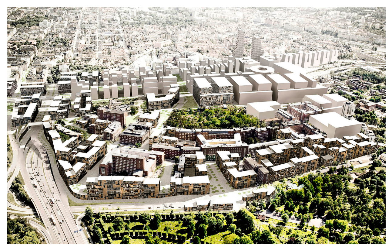
Fig. 3. Vision and imagery of Stockholm's Norra Hagastaden.

in China, UniCredit Bank Austria Campus and The Erste Bank Campus in Vienna and many others of its kind. All projects rest on the same premise: projects include massive square meters of residential areas, commercial and office areas, and other supporting facilities, such as parking, shopping, sports, schools, higher order social facilities, expanded multi-modal stations, cultural attractions, green areas, and even world-leading research in forms of either clusters, innovation districts, living labs or connections to business improvement districts (Figs 1-3). Architecture is seen as a medium that fits smoothly into the historic and natural spatial context of the city. Using retail to remake urban mixed-use environments is also seen as a possible anchor in this paradigm, which makes it a market urbanism variance. Finally all projects are strongly anchored to transit oriented development plus office concepts are designed to cater for a new corporate culture.