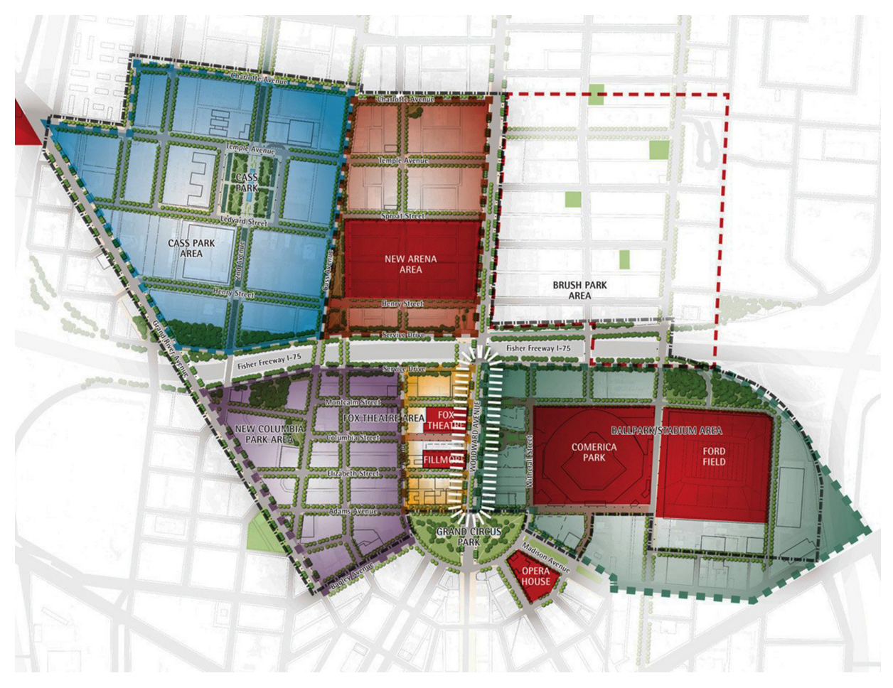
Fig. 6. Rendering of proposed District Detroit.

District Detroit", a sports and entertainment district which promises to bring new residential, office, retail and restaurant space in addition to the construction of a new sports arena, already completed. The development is by the Ilitch family and their company, Olympia Development. Crain's Detroit Business Journal called it "a dramatic transformation in the heart of Detroit", with the headline: "the Ilitch family breaks ground on a $450 million dollar arena with another $200 million in apartments, restaurants, office buildings, parks and shops over 45 blocks. This is the city's entertainment district, super-sized" (Shea 2014a). By the time the arena was completed in 2017, the cost had nearly doubled to $863 million. President and CEO Chris Ilitch described Detroit as "an investor's playground" and proclaimed "this project takes on a much bigger scale. There is nothing like this going on in our country" (Shea 2014a). Overall, the developer refers to it as an investment of $1.4 billion to act as a "driving catalyst of the city's remarkable resurgence"