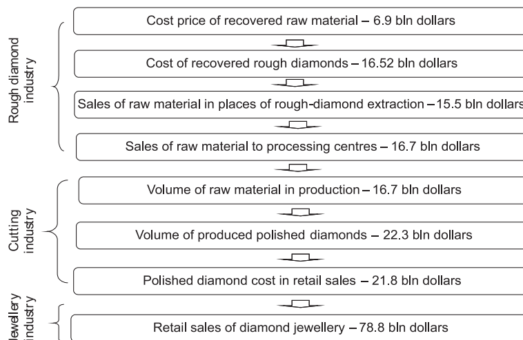
Fig. 1. The diamond pipeline – 2014 (based on Diamond pipeline 2014).

From an analytical point of view, the most informative and, consequently, the most frequently used is the industry rate of the cost increase at every product segment of the diamond pipeline. It enables researchers to determine what product segment on the market is the most or the least