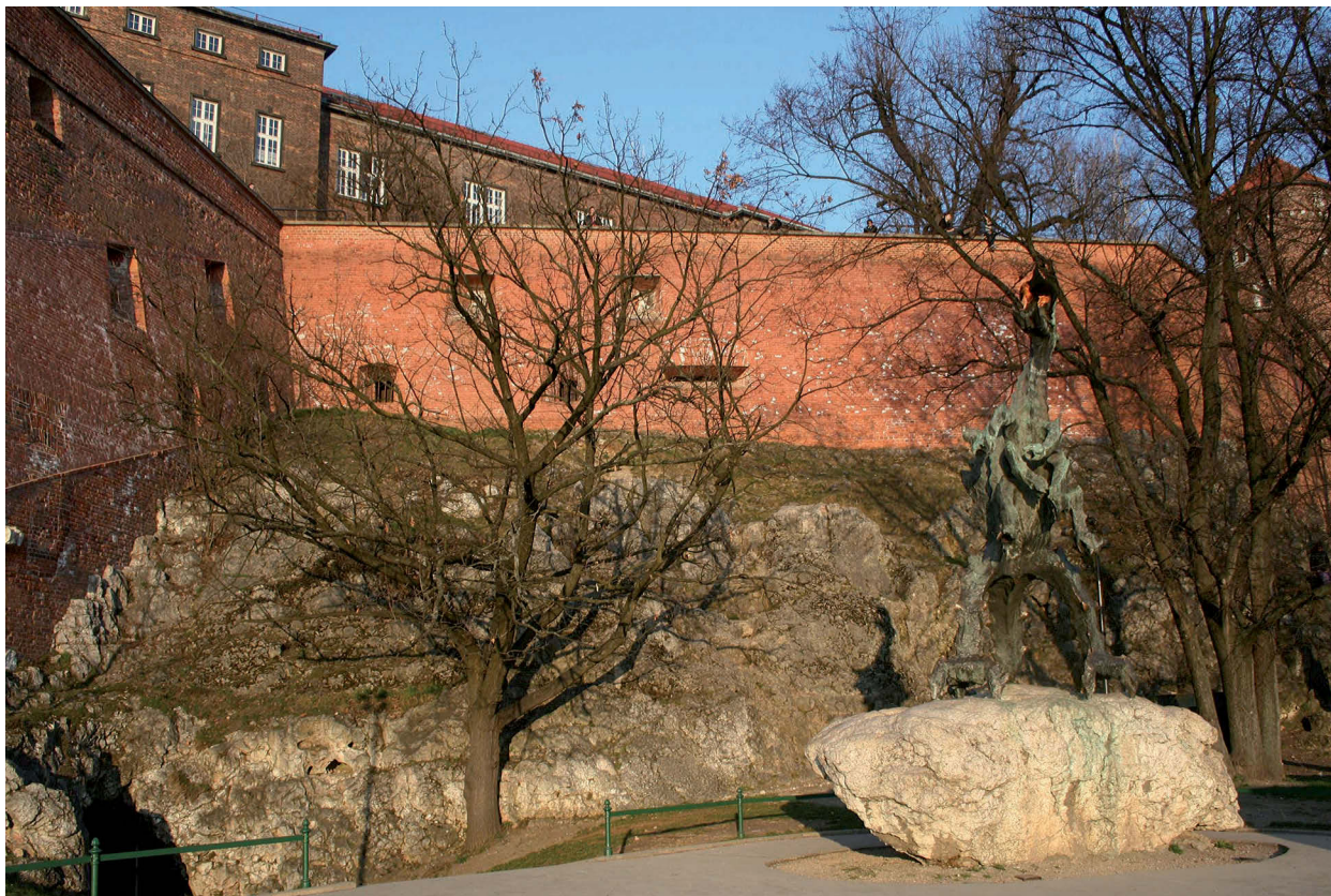
Fig. 8. Recultivated landscape – the Wawel hill breach and the Wawel Dragon