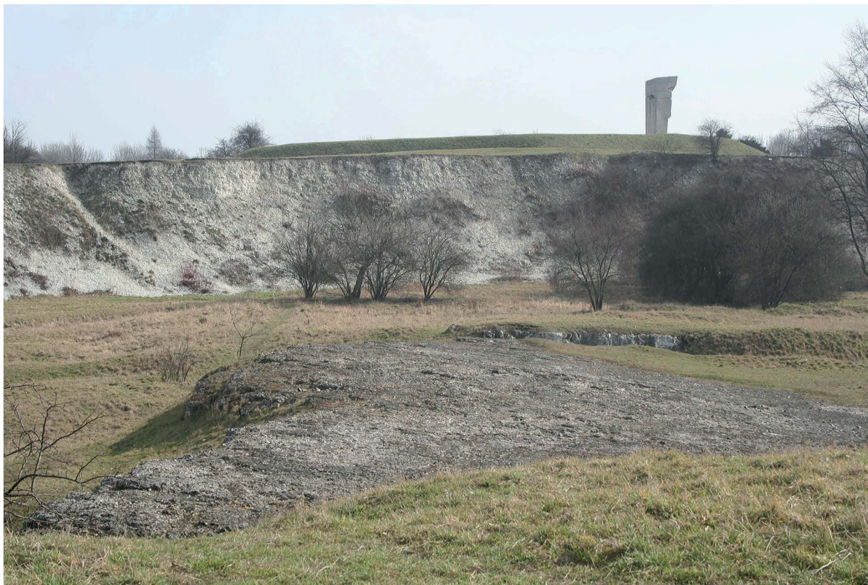
Fig. 7. Renaturalised landscape in the area of “Bonarka” quarry geological reserve