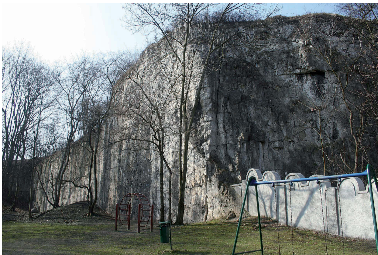
Fig. 10. Recultivated landscape in the area of “Pod Św. Benedyktem” quarry