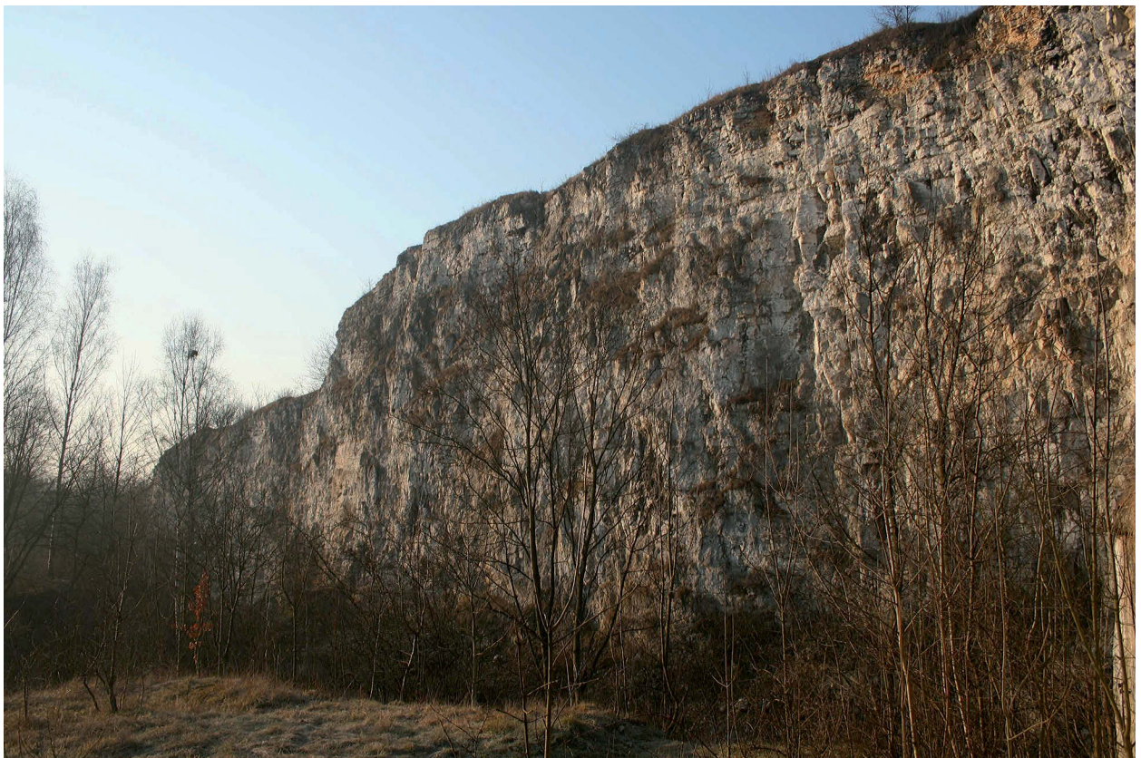
Fig. 4. Renaturalised landscape in the area of "Skalki Twardowskiego" quarry