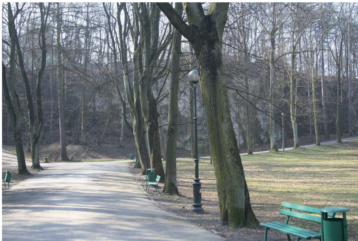
Fig. 9. Recultivated landscape in the area of “Szkoła Twardowskiego” quarry – Bednarski Park