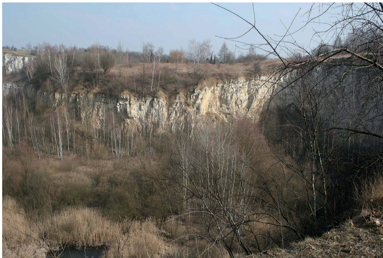
Fig. 5. Renaturalised landscape in the area in the South aspect of “Liban” quarry