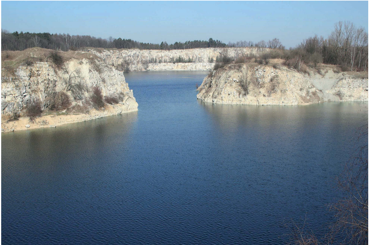
Fig. 3. Renaturalised landscape in the area of Zakrzówek Lake