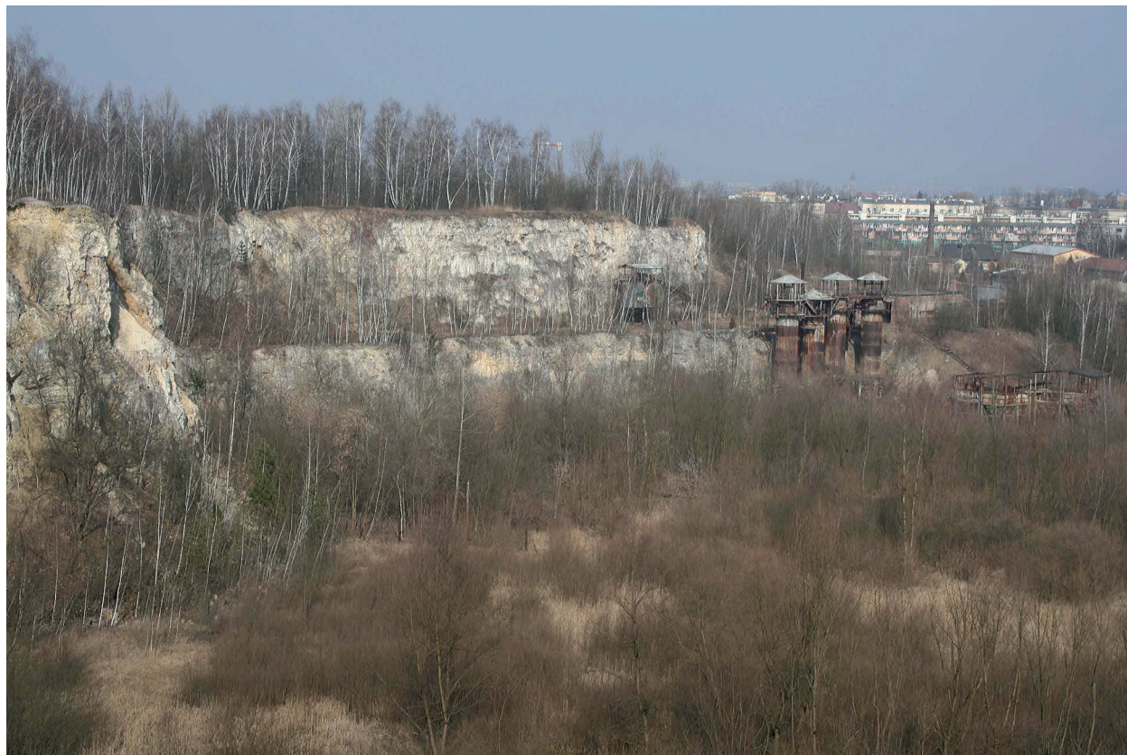
Fig. 6. Landscape in a renaturalisation process in the area in the North aspect of “Liban” quarry