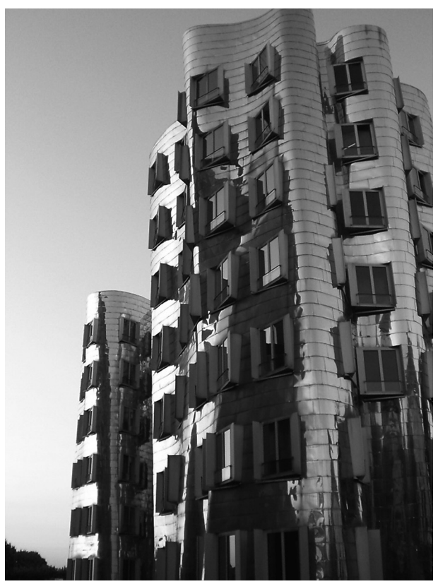
Fig. 1 & 2. The Media Harbour in Düsseldorf: Symbolic capital

trialisation, loss of workplaces and cutbacks in financial aid (Tempel 2006). According to a study by the DIW (Deutsches Institut für Wirtschaftsforschung, or the German Institute for Economic Research), half of the population does not own any financial assets, while 30% commands 90% of total private property (the richest 10 percent even owning 60% of this amount). The percentage of the middle class in terms of net income has fallen from 62.6% in 1991 to 53.9% in 2006 (Schäfer 2009; cf. also Pfaller 2012; Grabka, Frick 2008). The widening of the income gap and the diminishing of the 'healthy' middle class are a hot topic (Lengfeld, Hirschle 2009; Miegel et al. 2008). Additionally, the growing number of children threatened by poverty aggravates the situation in Germany: poverty during infancy is often seen as a trigger of health problems, unemployment, crime, and learning difficulties (Fertig, Tamm 2005).