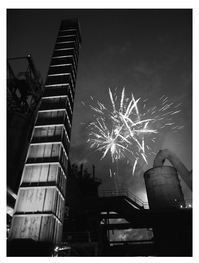
Fig. 3. Landscape Park Duisburg-Nord: a firework at the "Extraschicht" 2012

The Duisburg-North Landscape Park borders on the limits between a postmodern venue, a museum and a freely accessible space of daily recreation, and seems to combine different strategies of revitalisation. The park has offers for all groups regardless of budget and age. As a place of depolarisation, it was probably unplanned but nevertheless desired. It brings people with different interests together, at least spatially. From young skaters, senior walking groups, fans of piano concerts to climbing enthusiasts, the Land-