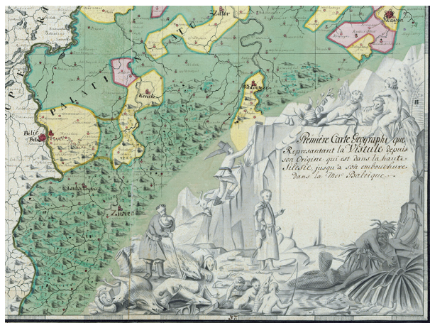
Fig. 2. Ornamental parerga and a part of the Żywiec Beskids (Beskid Żywiecki) together with Silesian Foothills (Pogórze Śląskie) on map sheet no. 1 (original copy scaled down).

Symbol system is unified for all sheets and is described in Latin. The characteristic feature of Czaki's map is the highlight of various kinds of ownerships with the help of colours. Golden line