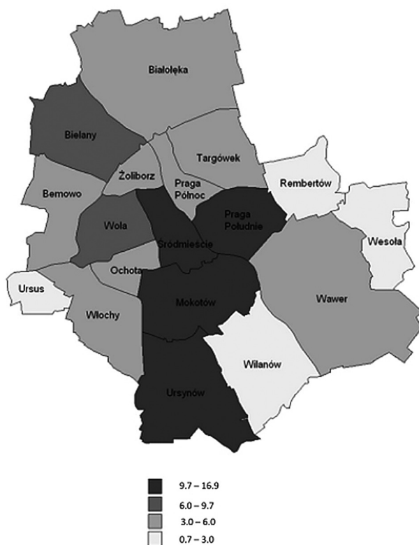
Fig. 2. Share of enterprises of the creative sector in the total number of enterprises in Warsaw by district, 2008.

Representatives of the creative sector have different opinions of Warsaw's attractiveness for their activity, but positive opinions are in the ma-