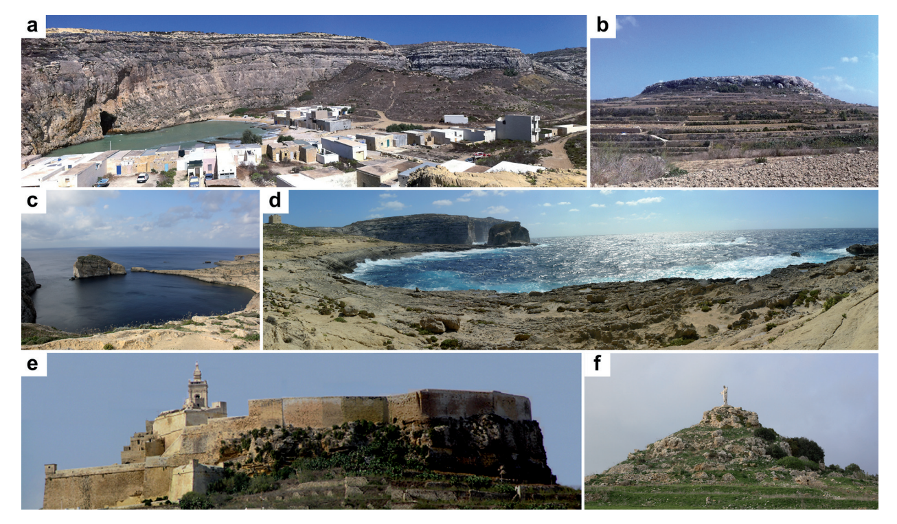
Fig. 3. Images of the sinkholes assessed as geomorphosites: a – Qawra (ID 8), b – Ghajn Abdul (ID 7), c – Dwejra Bay (ID 15), d – Dwejra North (ID 14), e – The Citadel (ID 6), f – Tas-Salvatur (ID 5).

Ghajn Abdul (Fig. 1, ID 7; Fig. 3b) is another sinkhole showing positive relief. It is a large calcareous mesa emerging from the surrounding clays. Its scientific value is due to the presence of a well-exposed sedimentary infill. Ghajn Abdul also shows a high historical value: it is thought that the people who first colonised Gozo in the Neolithic period lived in caves on Ghajn Abdul plateau.